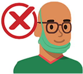
On your chin