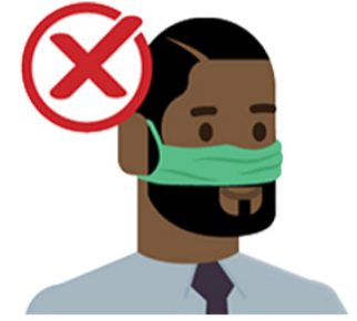
Only on your nose