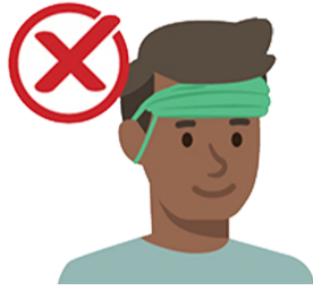
On your forehead