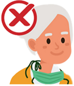
Around your neck