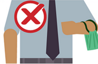
On your arm