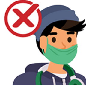
Under your nose