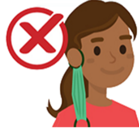
Dangling from one ear